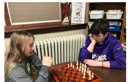
Chess & Cribbage Club