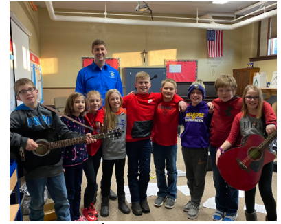
Sacred Heart Strings

** Will replace and upgrade the air conditioning unit in the office area spring 2020